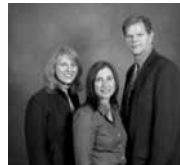
Hospitality and Tourism Award Prix de l'hospitalité et du tourisme Canada Science and Technology Museum