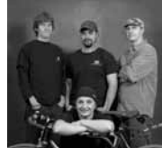
Employer Award Prix de l'employeur Cycle Salvation