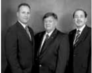
Accessibility by Design Award Prix Accessibilité intégrale Delcan Corporation