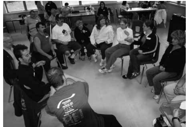
Playing “Pass the Object”