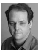
Education Award* Prix de l'éducation Freedom at Depth / Liberté en Profondeur Canada